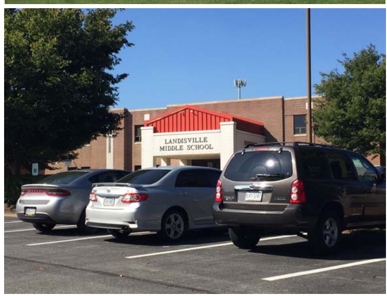
Landisville Middle School 340 Mumma Drive Landisville, PA 17538

Millennium Engineering, P.C. 132 Jaffrey Road Malvern, PA 19355